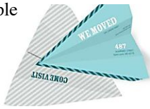
13 Unique Moving Announcements