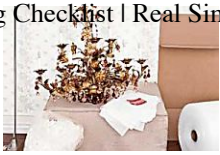
Moving Packing Tips