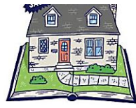
Steps to Buying a House