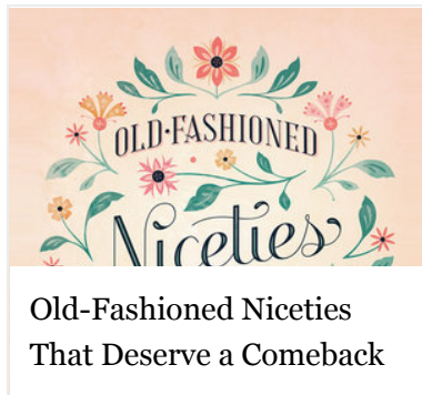
Old-Fashioned Niceties That Deserve a Comeback