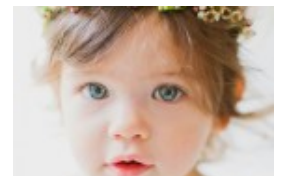
15 Old-Fashioned Baby Names That Will Melt Your Heart