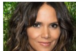
The 8 Best Haircuts If You're Over 30